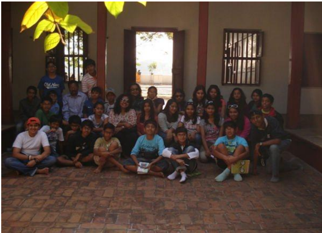
We went, We saw, We learnt at the Sabarmati Ashram