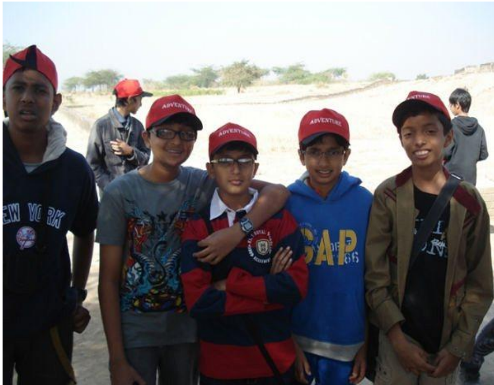
Budding archaeologists at Lothal