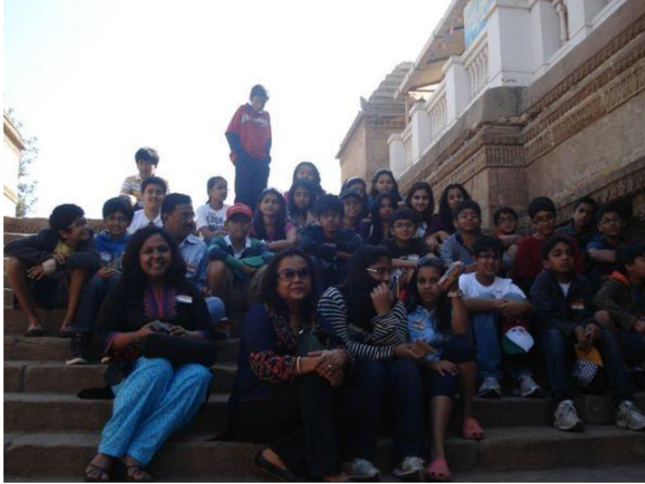
Ready to step into the Step Well at Adlaj near Ahmedabad