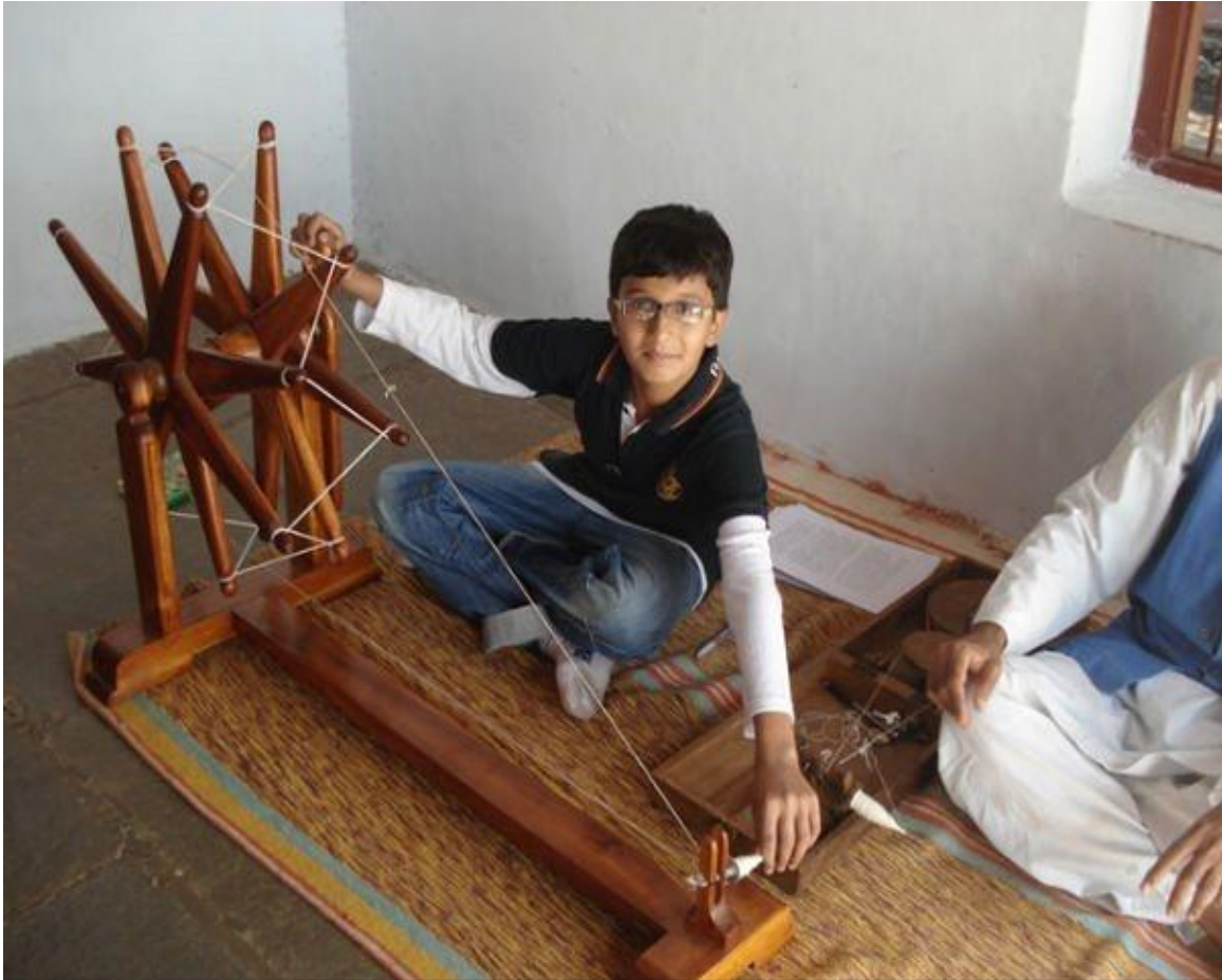
Experiencing the Gandhian way of life at Sabarmat